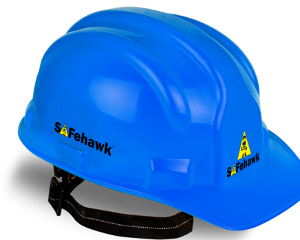
Blue : For Electricians, Carpenters And Other Technical Operators.