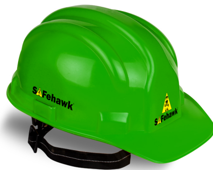
GREEN : For Safety Officers.