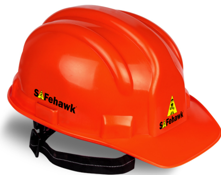
RED : For Fire Fighters.