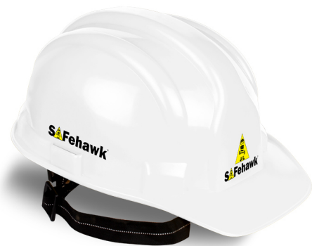
WHITE : For Engineers, Managers Supervisors And Foremen.

Difference Between Defferent Safety Helmets Colors: