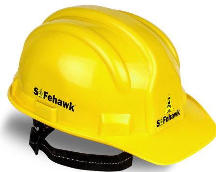
YELLOW : For Labourers And Earth Moving Operators.