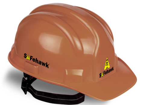
Brown : For Welders, And Workers With High Heat Application.