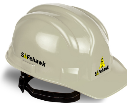
GRAY : For Site Visitors.